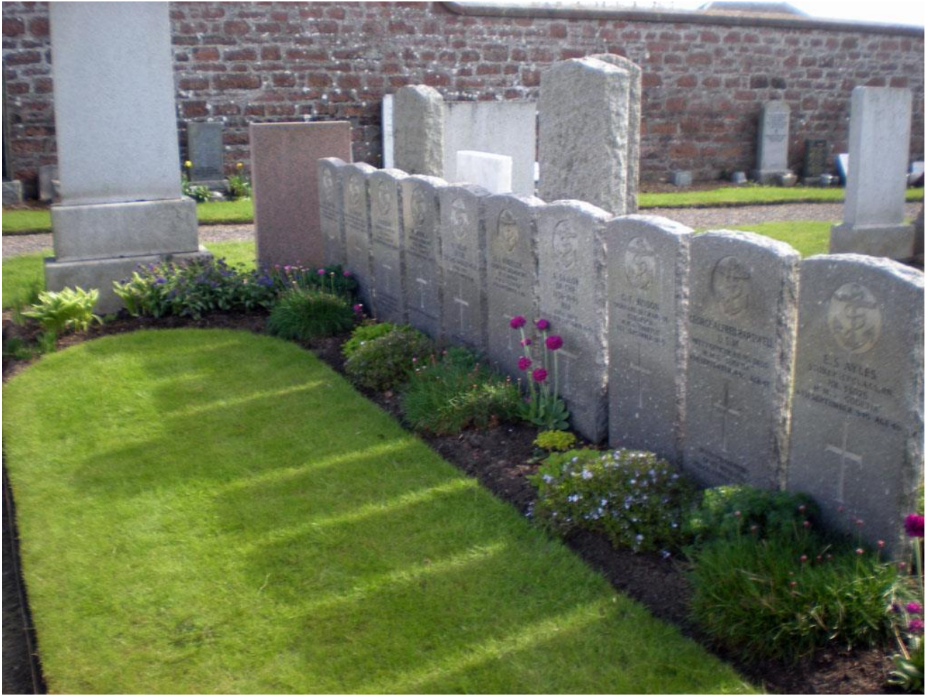
Doone Cemetery, Girvan, Ayrshire, Scotland