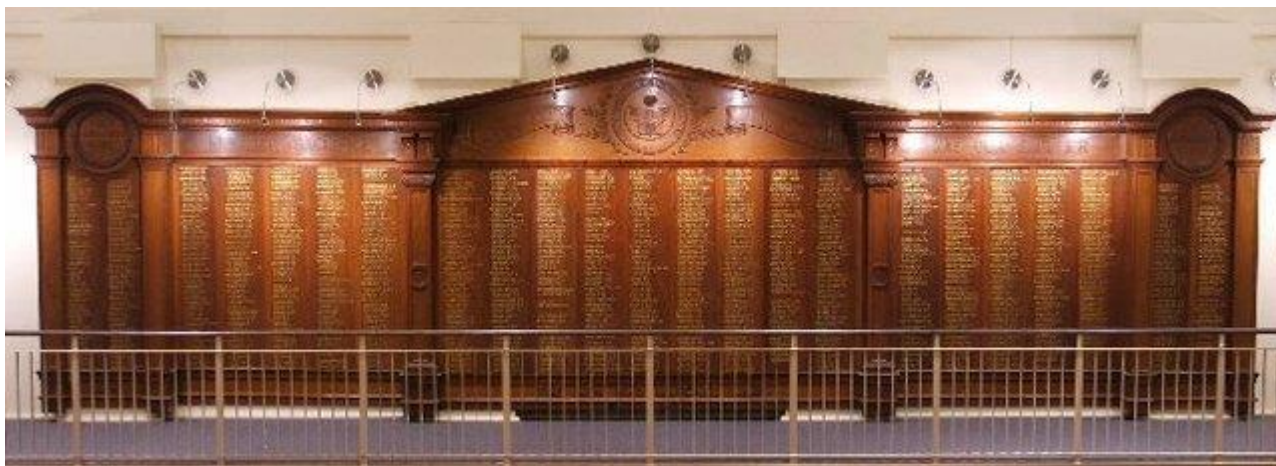
Unley City Honour Roll

R. H. Grove is remembered on the Unley City Honour Roll, located in the Town Hall, Unley Road & Oxford Terrace, Unley, South Australia.