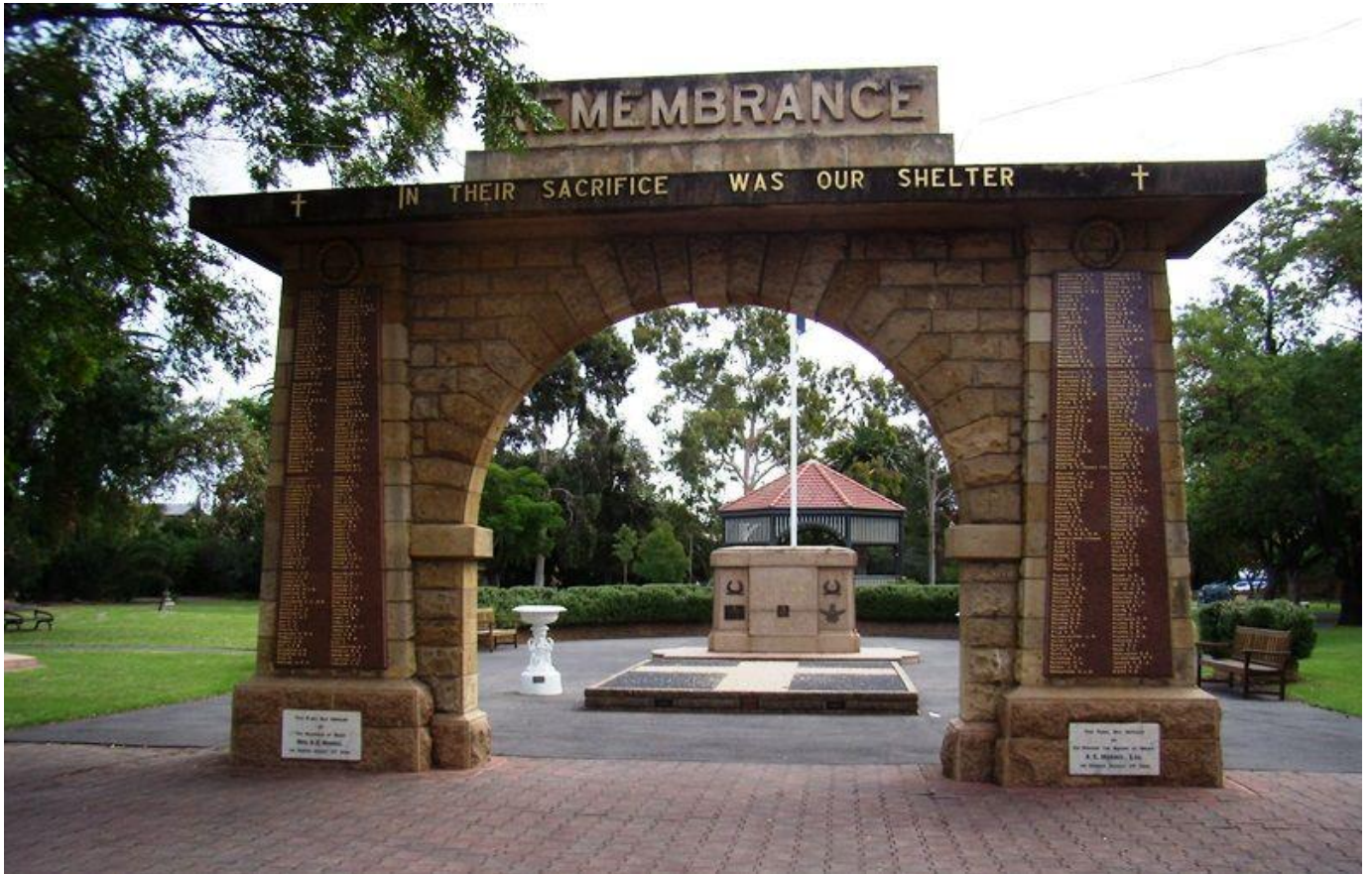
Unley Memorial Arch