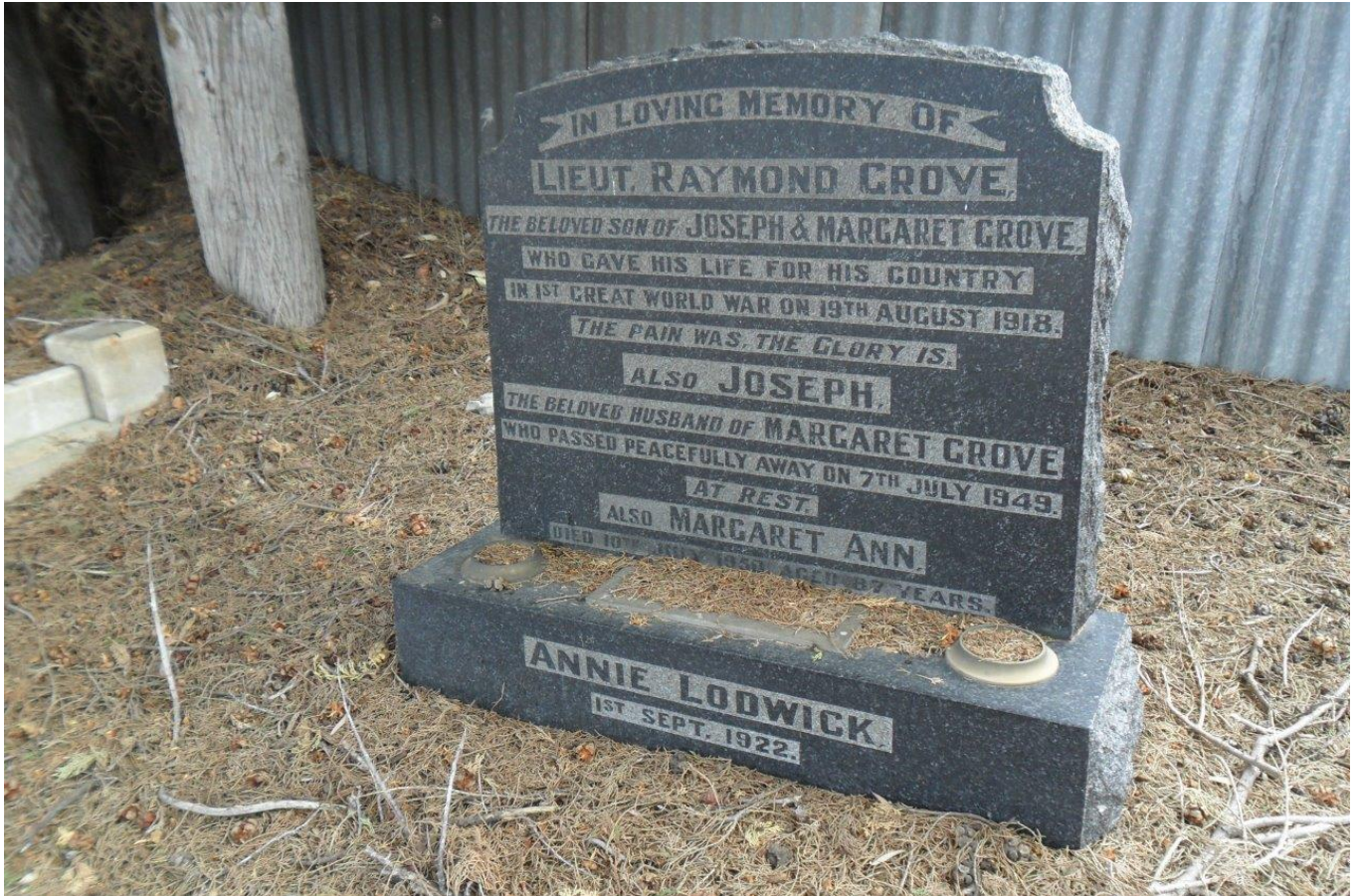
Grove Family Headstone in Mitcham General Cemetery, South Australia